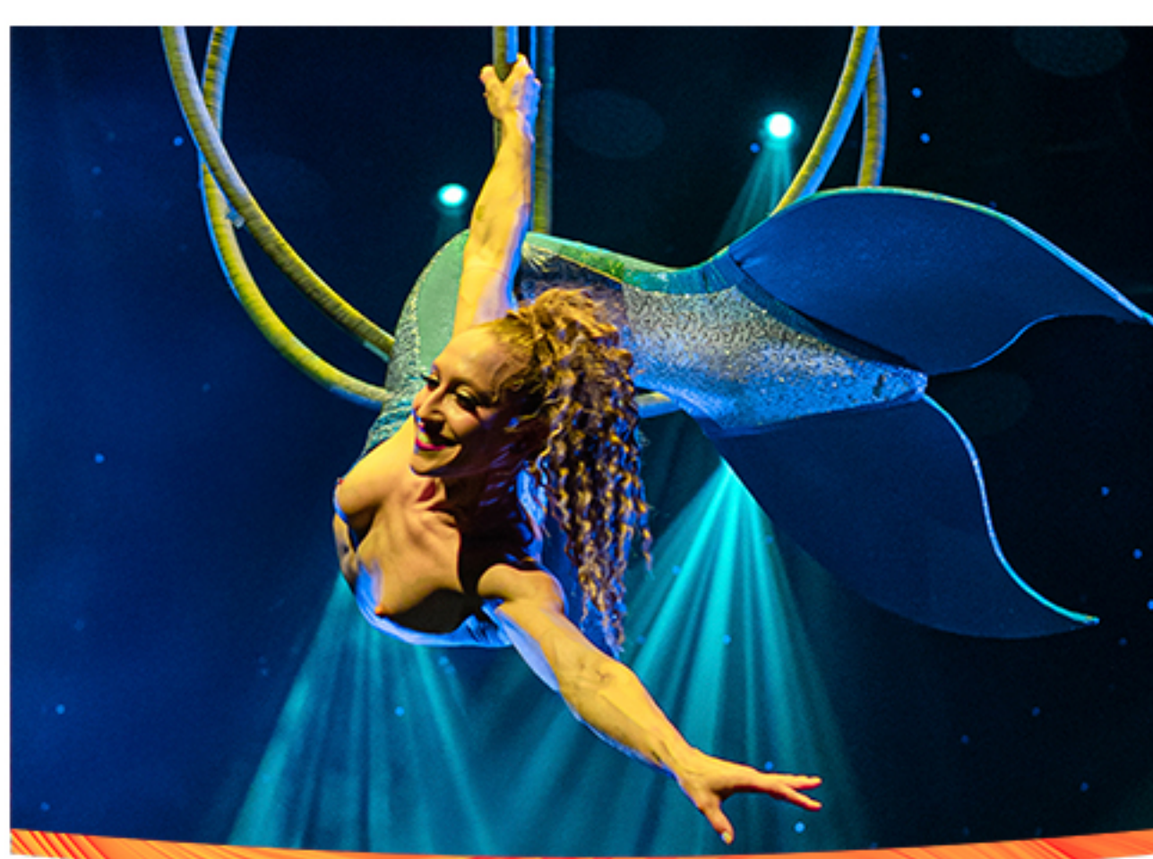
FRESHLY UPGRADED ENTERTAINMENT