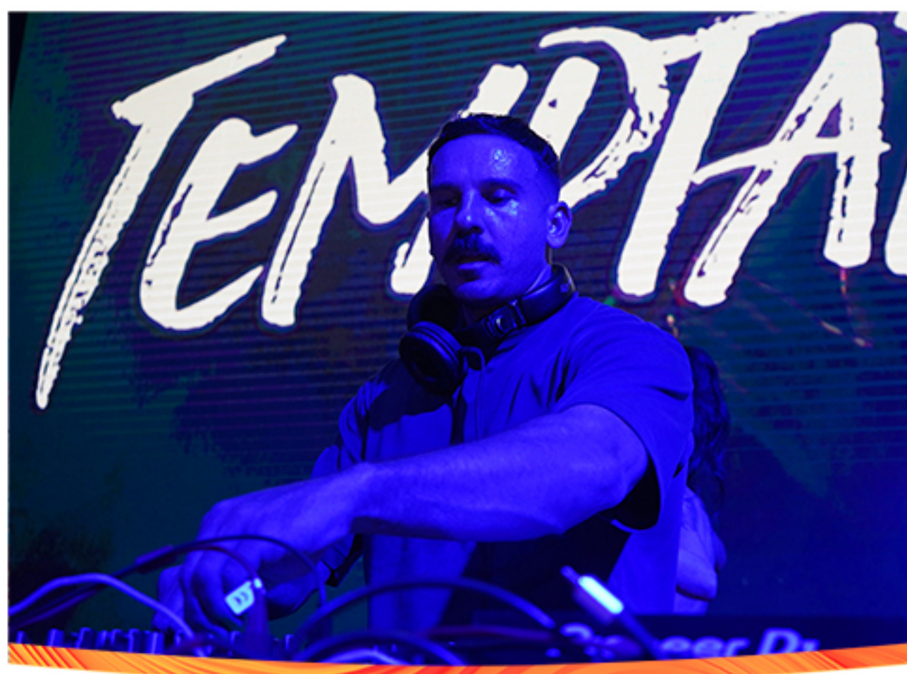
SPECIAL GUEST DJS