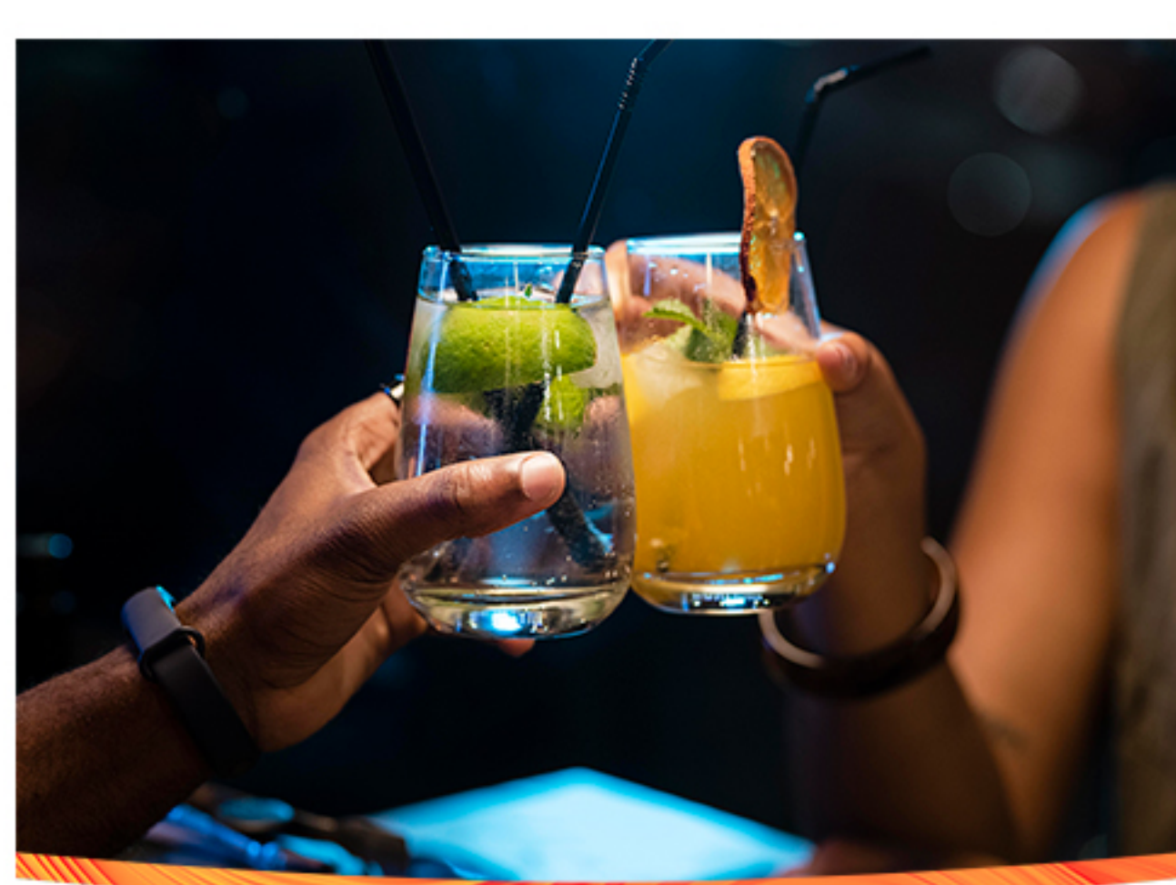
UNLIMITED OPEN BAR BEVERAGE PACKAGE