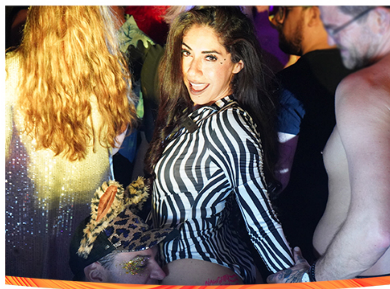
SEXY THEME NIGHTS