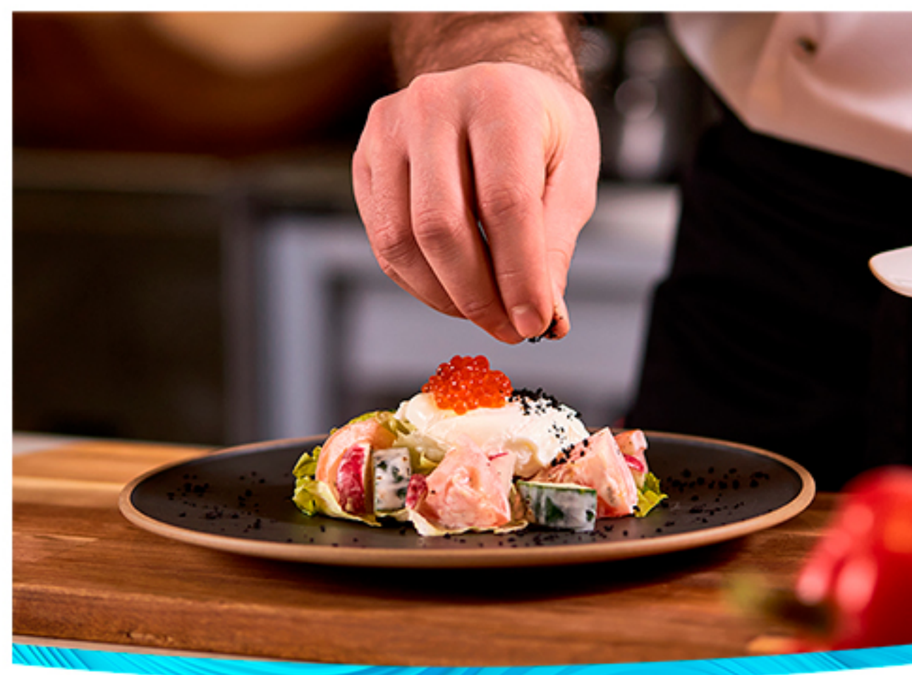
COMPLIMENTARY WINING & DINING